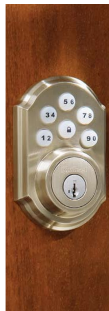
909 SmartCode™ Signature Series