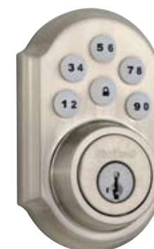
NEW 909 SmartCode Signature Series