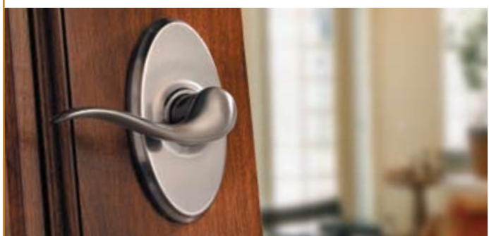
Oval Rose with Tustin®